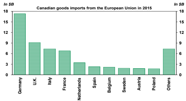
Graph 3 – The United Kingdom also has a big presence in Canadian imports from the European Union

Sources: Industry Canada and Desjardins, Economic Studies