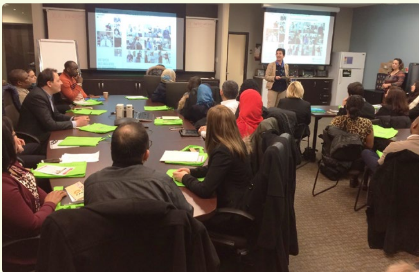
Careers at Desjardins—March 8, 2016.

This partnership is in its second year, and we are proud to be part of it! The Centre d'appui aux communautés immigrantes (CACI) offers its services to immigrant communities throughout the greater Montreal area. Emploi Diversité is a CACI Social Economy project sponsored by the Caisse. It connects qualified immigrant job seekers with potential employers, taking into account Quebec job market requirements.