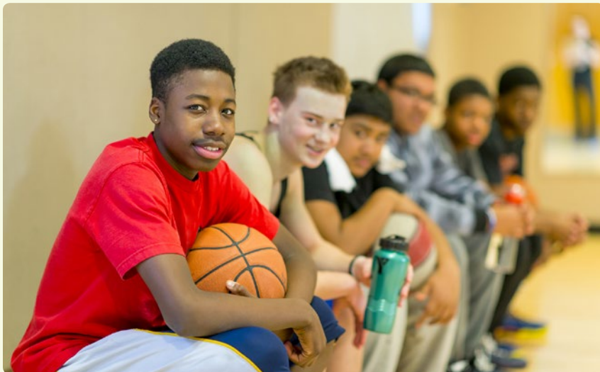
A few participants of Free Friday Teen.

Caisse Desjardins de Bois-Franc-Bordeaux-Cartierville has provided Cartierville YMCA with $15,000 in funding to support the organization's inspiring Free Friday Teen initiative.