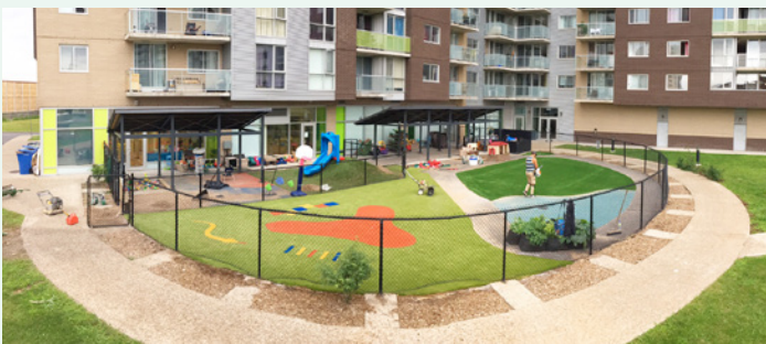
The CPE's fun new playground.

Our caisse provided partial funding for the playground at the CPE Château-de-grand-mère's Acadie location. Caisse Desjardins Saint-Joseph-de-Bordeaux committed $25,000 in 2010 and made the first $5,000 installment in 2012. The remaining payments were conditional upon completion of the CPE.