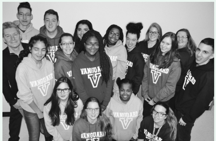
Some Vanguard students.

Thanks to financial assistance from our Desjardins partners, we are proudly providing $250,000 in sponsor support over five years to the Vanguard Foundation. Desjardins has been supporting the Vanguard School since it opened in 1973. This unique educational institution is now recognized as one of the best schools for students with severe learning disabilities. In addition to enriching student services, the grant will help make the expertise and tools developed at the Vanguard School more accessible across Quebec.