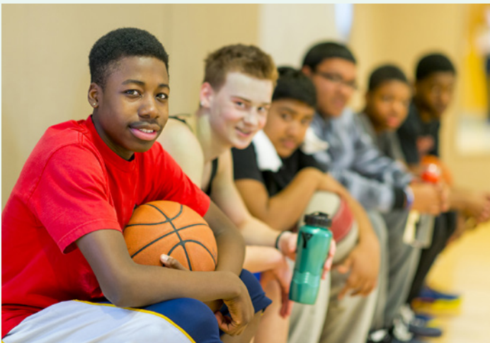
Young people at Teen Friday.

Our caisse supports the Cartierville YMCA and its popular Teen Fridays. The YMCA is a mainstay of the Cartierville community and has more families than any other YMCA in Quebec. Many young people come out to these free evening events to have fun with friends.