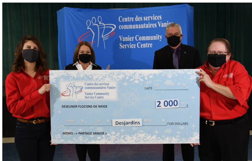
Vanier Community Service Centre