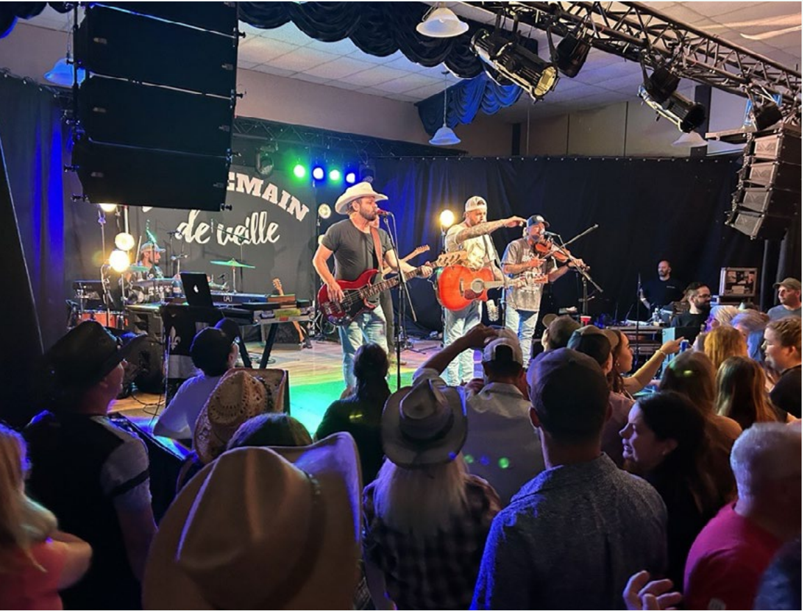
« Lendemain de veille » performing at the Festival de la Curd 2024.

Festival du Loup is a vibrant celebration of French language and culture, highlighting francophone arts and heritage. This highly anticipated event gives the Lafontaine community a chance to take in rich, diverse programming like musical performances, storytelling events and a living museum in a fun and festive atmosphere.