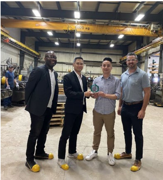
Niagara Fasteners manufactures high-quality, customizable nuts and bolts that comply with nuclear quality standards and meet the many needs of a wide breadth of industries.

We awarded a total of $220,000 to 21 business project through the Momentum Fund program.