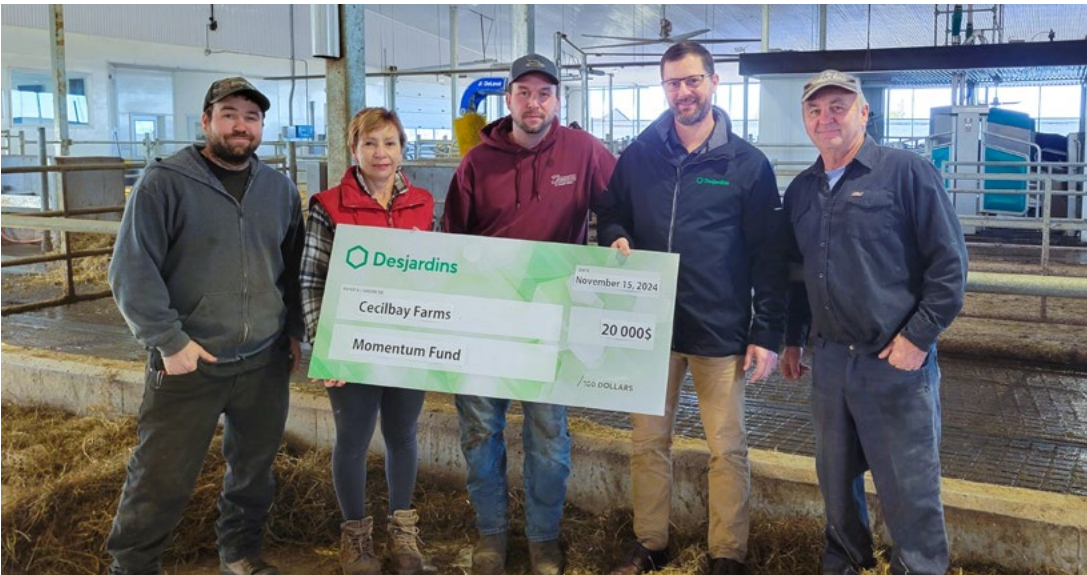
Cecilbay Farm received money from the Momentum Fund to invest in the very first automated feeding system for cows in North America. Although there are other automated feeding systems out there, this one presents a number of benefits that are quite innovative. This cutting-edge technology is on track to improve the well-being of animals and optimize agricultural resources.