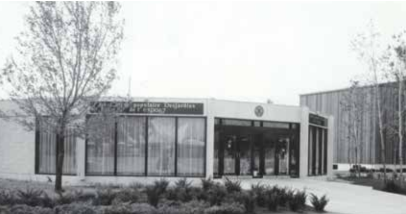
Desjardins caisse at Expo 67 in Montreal