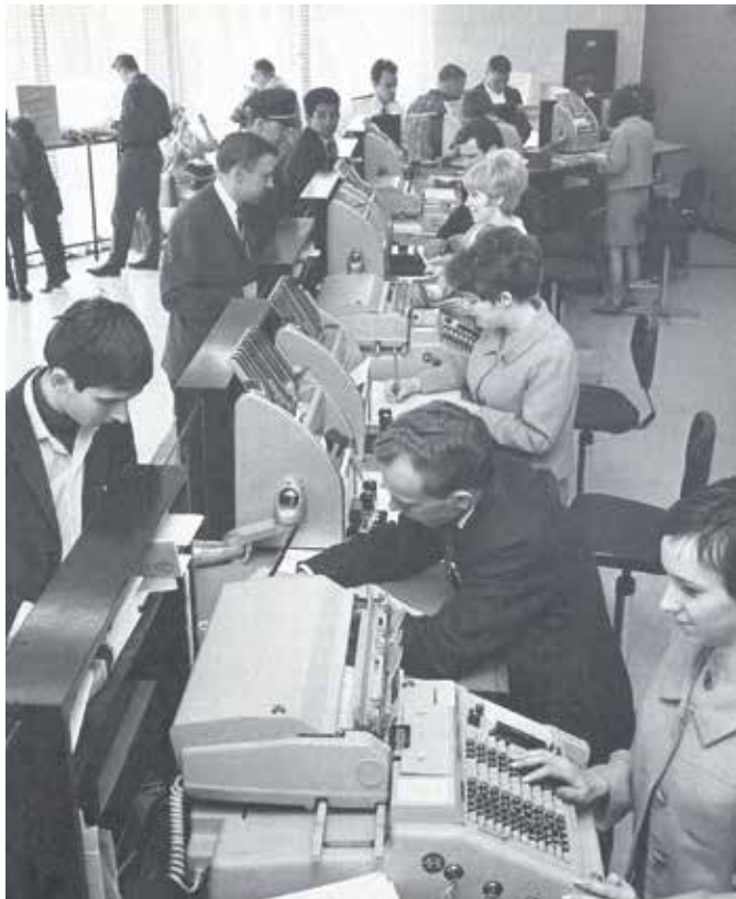
Interior view of Desjardins caisse at Expo 67 in Montreal