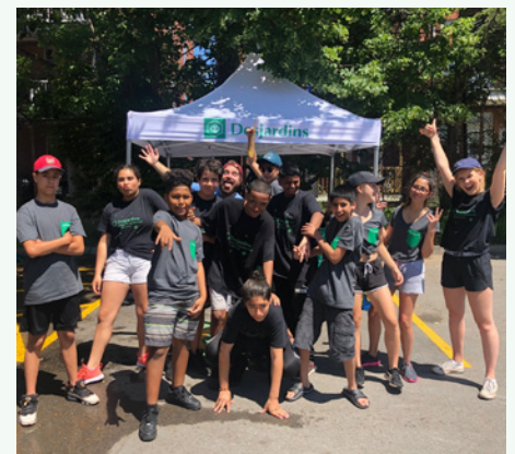
Carwash with Co-op des jeunes de Villeray.