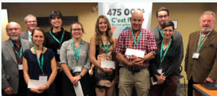
Handing out the MotivAction scholarships, 2019