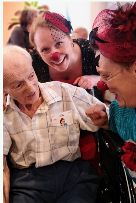
Therapeutic clown program for seniors at Résidence Berthiaume-Du Tremblay.