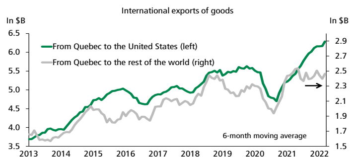
GRAPH 2 Quebec exports to non-US destinations are leveling off

Sources: Institut de la statistique du Qu bec and Desjardins, Economic Studies