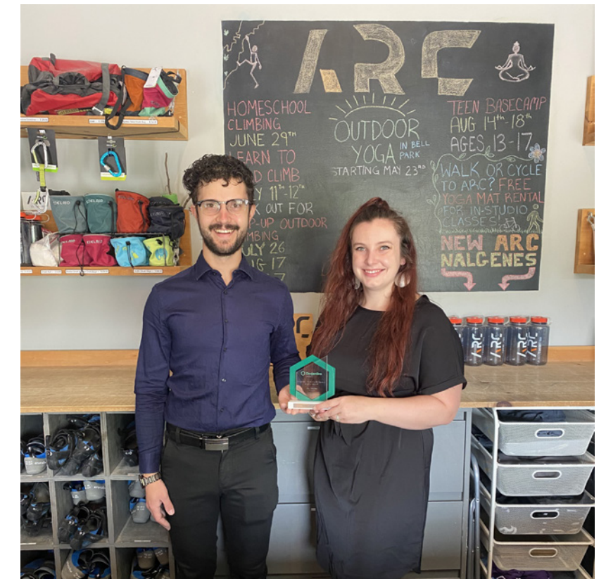
Arc Climbing is an indoor climbing gym and yoga studio in Sudbury. The funds provided by the Momentum Fund enabled the purchase of new equipment and the redesign of the facility's layout.