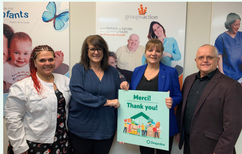
Groupe Action and Maison de la famille de Hawkesbury are purchasing snowsuits to gift to local children.

Desjardins Ontario Credit Union is proud to have donated $100,000 to organizations in Ontario to help those in need through the holidays and spread a little happiness. Thanks to the Help our Neighbours Campaign, several food banks, snowsuit for kids programs, and associations providing services to people in need received additional financial support.