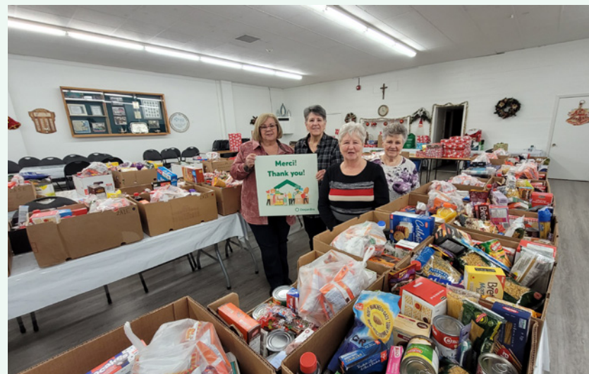
Fédération nationale des femmes canadiennes françaises donated food baskets for the holiday season.