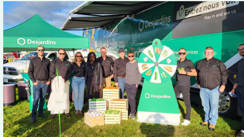
The agriculture team showcased our financial services for farmers at Canada's Outdoor Farm Show in Woodstock.