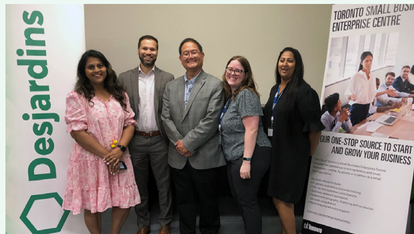
Thanks to a partnership between the City of Toronto and Desjardins Ontario Credit Union, our Desjardins Business professionals are on hand to meet with entrepreneurs at 2 Toronto Small Business Enterprise Centre locations in North York and Scarborough to discuss their business needs and opportunities and help them make solid plans.