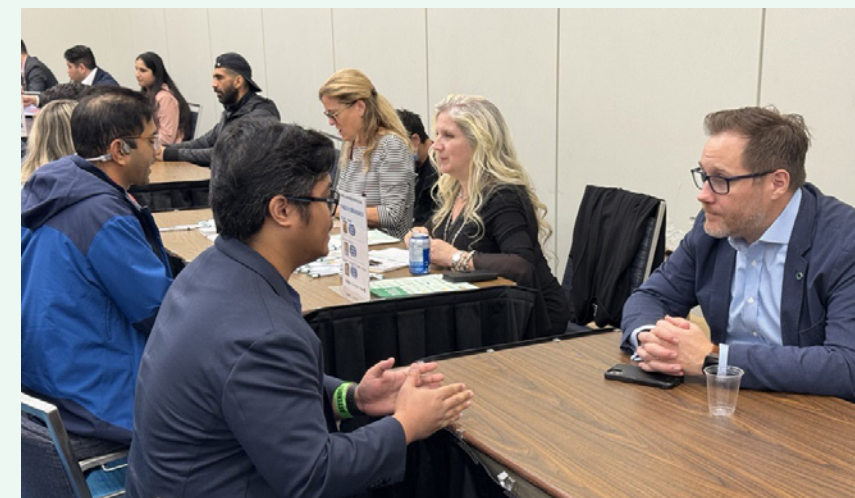
The City of Toronto's Small Business Forum provides an opportunity for future business owners to meet with the Desjardins team to talk about their vision and map out their business plan.