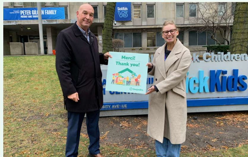
Helping children during the holiday season through a donation to the SickKids Foundation.