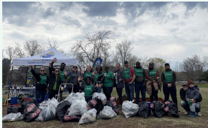
Ottawa Riverkeeper shoreline cleanup