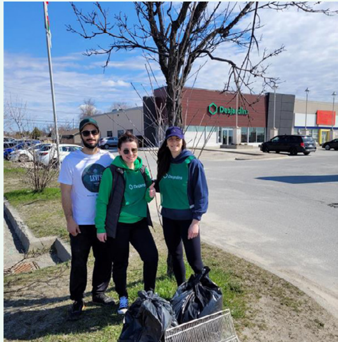
Sudbury Clean Up Blitz

Desjardins Ontario Credit Union contributed to a number of initiatives to protect our planet and encourage people to do their part for the environment. Our staff and administrative team took part in initiatives to clean up garbage and plant trees.