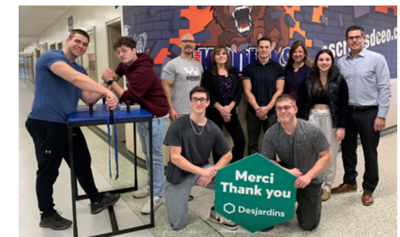
2 nd edition of the regional arm wrestling tournament at École secondaire catholique Régional de Hawkesbury.