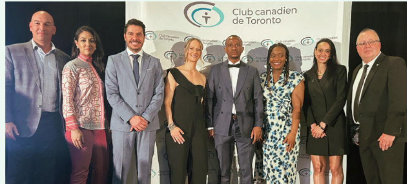
Our managers were at the event organized by Club Canadien de Toronto to congratulate the young winners of the Prix RelèveON.

The Desjardins Business centre team participates in various events to meet with business owners and discuss their financial needs. Our account managers support members through the various stages of their business life cycle and growth.