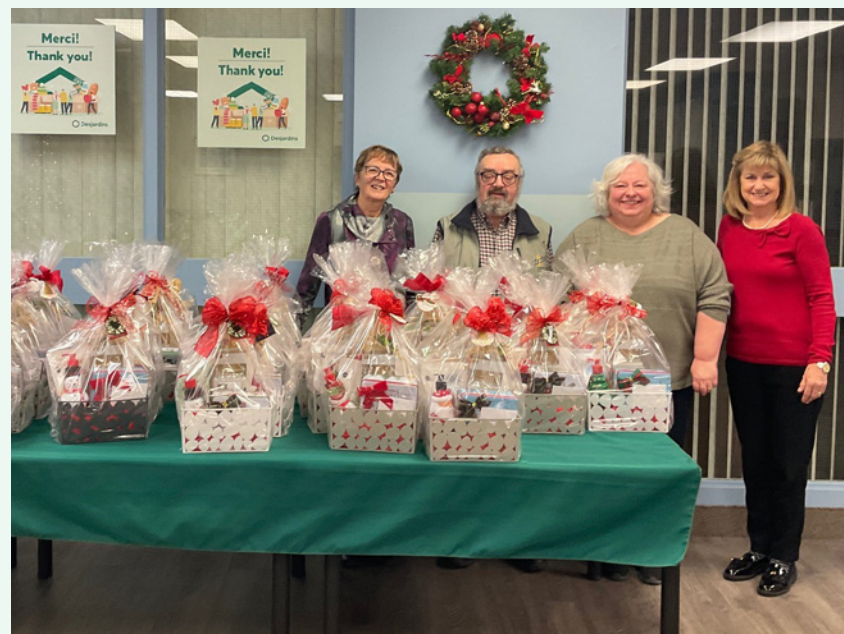
Rendez-vous des aînés francophones d'Ottawa (RAFO) donating gifts baskets.