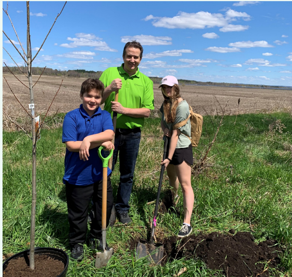
Prescott and Russell Recreational Trail tree planting