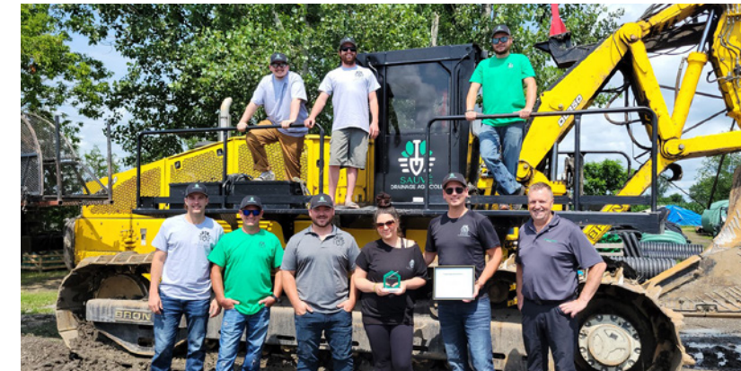
Sauvé drainage agricole inc. is a young drainage company operating in eastern and northern Ontario. The financial support from the Momentum Fund has enabled the company to acquire a GPS system and an equipment control system.

Desjardins Ontario Credit Union distributed $170,000 of funding to 19 business projects in Ontario through the Momentum Fund . Selected projects can receive up to $20,000 in support. We support projects in the categories of innovation, business transfers, exports, business succession, energy efficiency initiatives, ergonomic and public health measures, digital transformation, psychological support, and business model change.