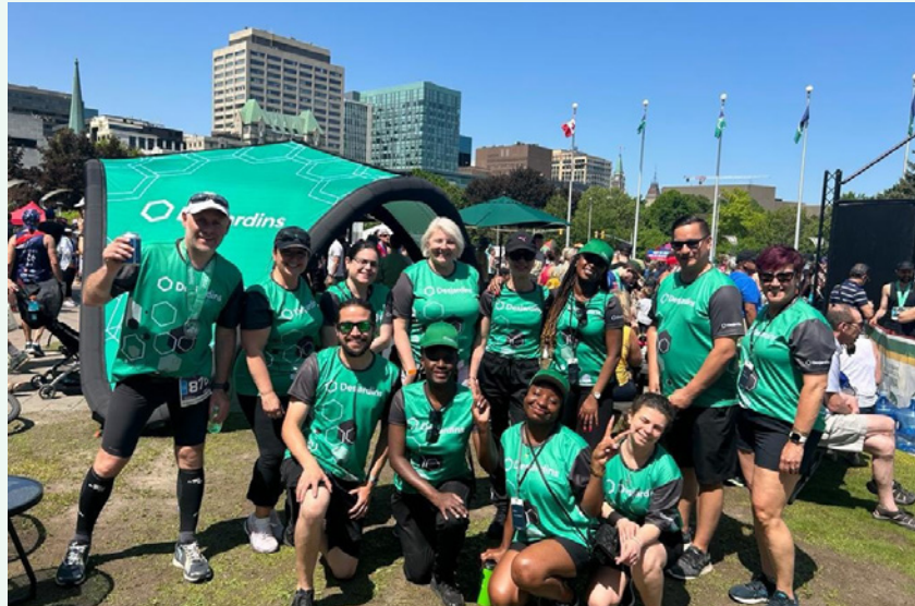
Run Ottawa organizes running events that attract runners from all over and help raise funds for many community organizations.

Desjardins Ontario Credit Union is a partner of many community running events. Sponsorships such as these enable us to support various fundraising campaigns for charitable organizations while promoting health and physical activity.