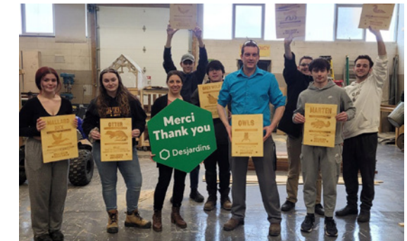
Creation of signs for the wellness trails.

Through the Desjardins Foundation Prizes, we award schools and community organizations grants of up to $3,000 for projects involving kids in kindergarten through high school. The program encourages teacher mobilization and provides them with an opportunity collaborate, engage and motivate their students. In Ontario, over $250,000 in funding went to 91 projects.